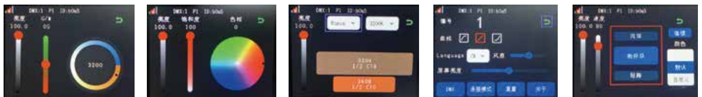
Color temperature menu Color temperature menu Gel menu Settings menu special effects menu