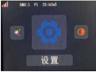
Ballast setting options